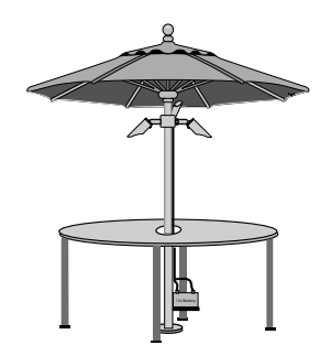
Connect to 12V Battery (Focus WB-12 Portable Battery) Recommended for LED Only

LED operation on full charge = 30+ hours Halogen operation on full charge = 4 hours