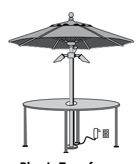
Plug In Transformer (Focus PI-12-75 Plug-in Transformer) Plugs into 120v outlet Only for use with Halogen Not compatible with LED

LED operation on full charge = 30+ hours Halogen operation on full charge = 4 hours