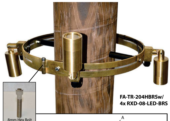
FA-TR-204HBRsw/ 4x RXD-08-LED-BRS

Note: All fixtures, drivers & transformers sold separately