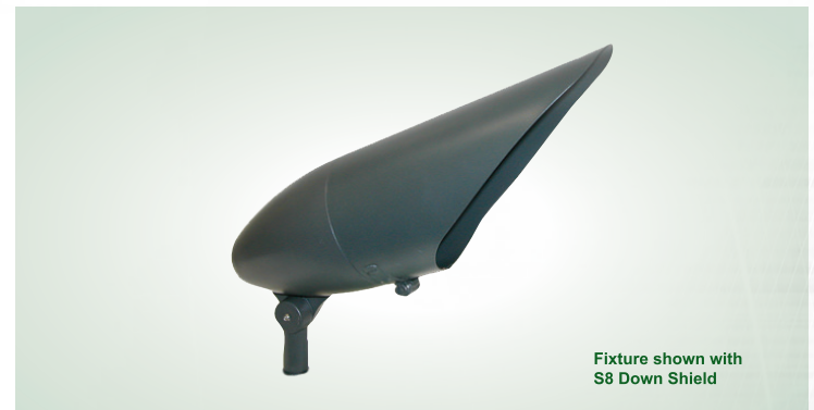
Fixture shown with S8 Down Shield