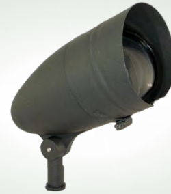
Fixture shown with S4 Down Shield