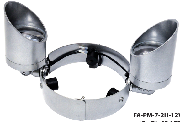
FA-PM-7-2H-12V-CPR w/ 2x DL-45-LEDMCPR