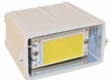
Shown installed in Back Box (Driver behind LED)