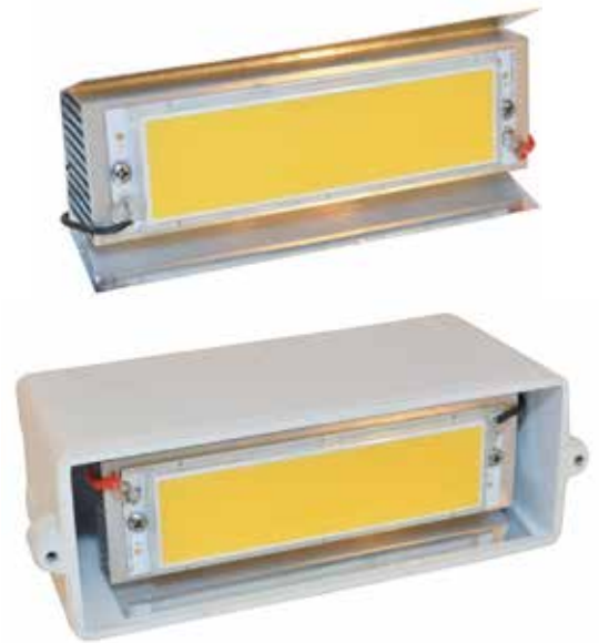
Shown installed in Back Box (Driver behind LED)