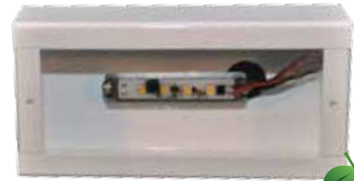
2w WATERPROOF LED STRIP