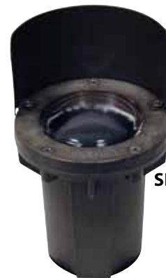
SL-20-SMLLEDP2040 with FA-135SM-BRT