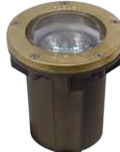
SL-20-SMLNL120V-BRS with PAR20 lamp installed