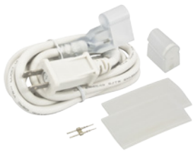
P2-NF-CONKIT-8A 120V power connection kit Includes: (1) 120V AC 5ft power cord with 8A inverter, (1) power pin, (1) end cap and (2) 4" sections of shrink tube