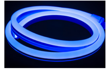
P2-NF-BL (120V) P2-NF-24V-BL (24V) Blue LEDs Opaque blue jacket (120V) 469nm • 5Lm/ft (24V) 469nm • 9Lm/ft