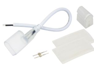
P2-NF-CONKIT-NP 24V power connection kit Includes: (1) 5ft power cord (without plug, without inverter), (1) power pin, (1) end cap and (2) 4" sections of shrink tube