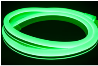
P2-NF-GR (120V) P2-NF-24V-GR (24V) Green LEDs Opaque green jacket (120V) 520nm • 25Lm/ft (24V) 521nm • 50Lm/ft