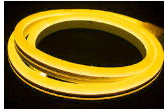
P2-NF-AY (120V) P2-NF-24V-AY (24V) White LEDs Opaque Amber jacket (120V) 590nm • 21Lm/ft (24V) 590nm • 34Lm/ft