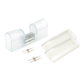
P2-NF-SPLS Splice Kit Includes: (1) connection sleeve assembly, (2) power pins, and (2) 3" sections of shrink tube (Bag of 10)