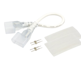
P2-NF-JUMP5 6" cable P2-NF-JUMP3 3ft cable P2-NF-JUMP10 10ft cable P2-NF-JUMP20 20ft cable Jumper (linking) cables Includes: (2) power pins and (2) 4" sections of shrink tube