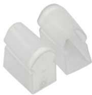
PLR-NF-ENDS Clear plastic end caps (10 per bag)