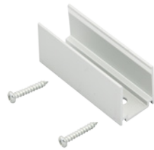
PLR-NF-CLIPS 2" aluminum mounting clips with (2) mounting screws