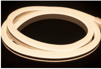
P2-NF-WW (120V) P2-NF-24V-WW (24V) Warm White LEDs • 79CRI Opaque white jacket (120V) 2700K • 63Lm/ft (24V) 2700K • 90Lm/ft