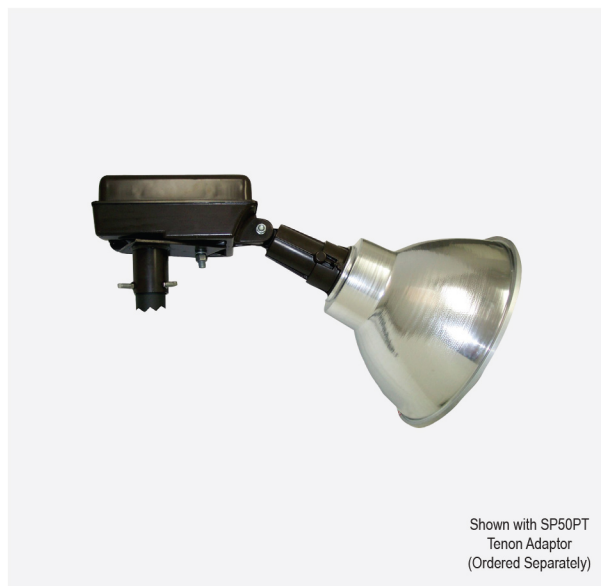
Shown with SP50PT Tenon Adaptor (Ordered Separately)