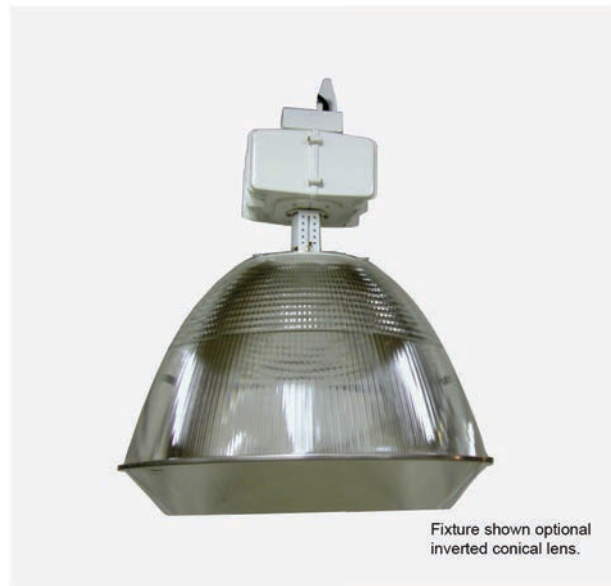
Fixture shown optional inverted conical lens.