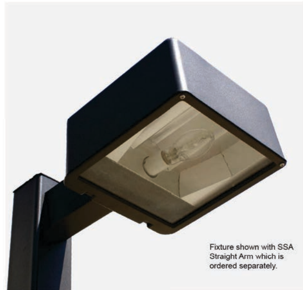
Fixture shown with SSA Straight Arm which is ordered separately.