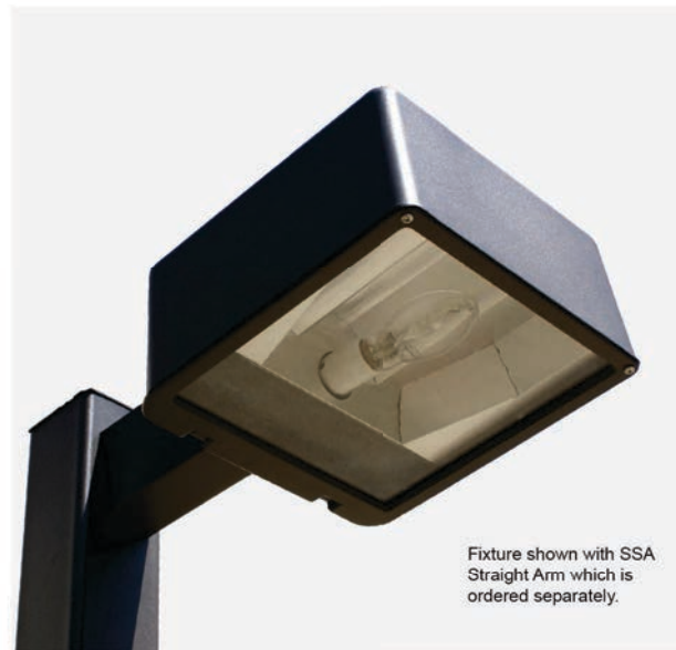
Fixture shown with SSA Straight Arm which is ordered separately.