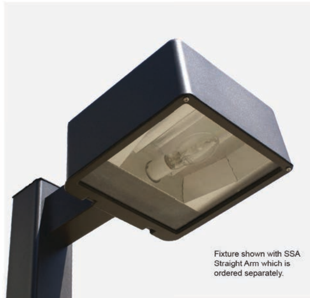
Fixture shown with SSA Straight Arm which is ordered separately.