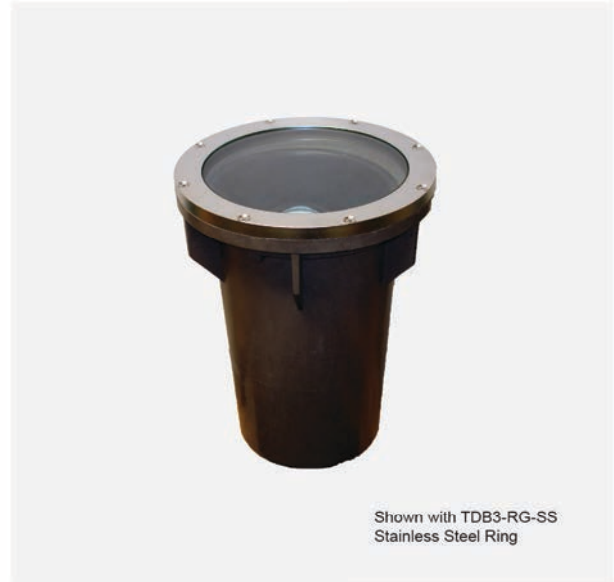
Shown with TDB3-RG-SS Stainless Steel Ring