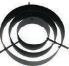
TDB3GG Internal Louver