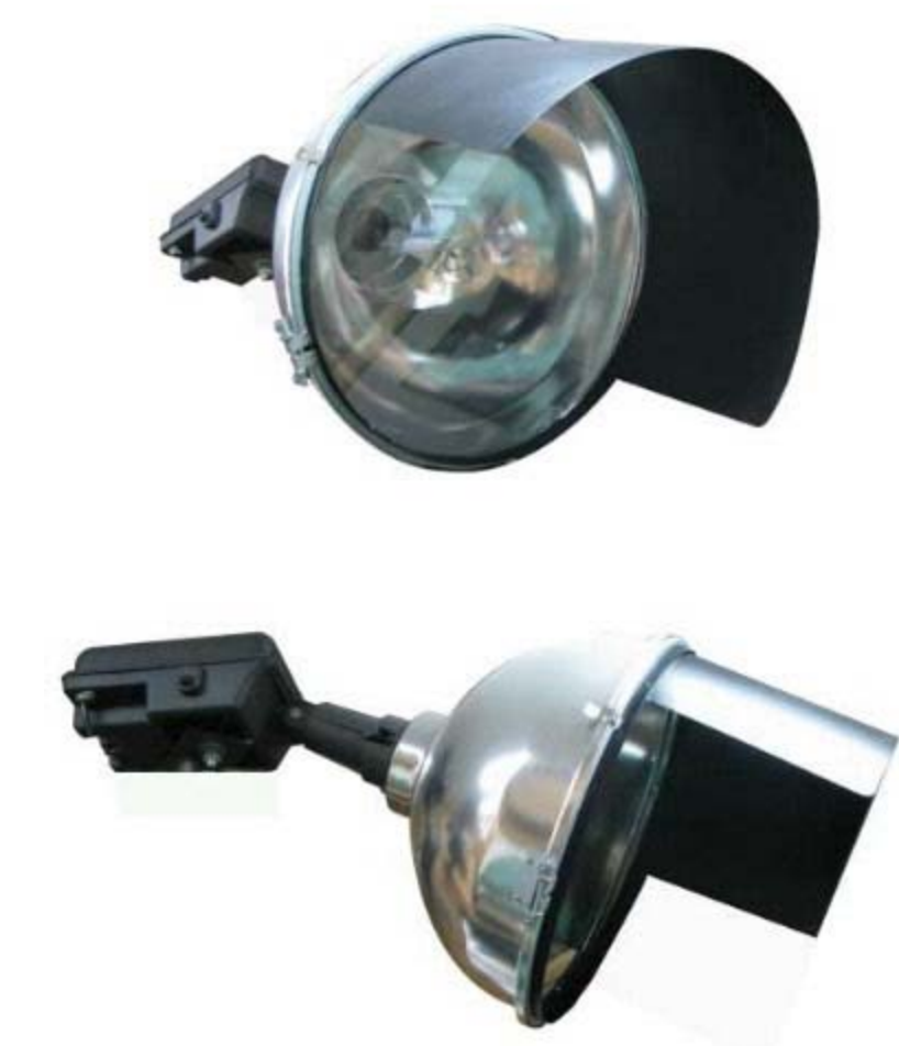
FIXTURE SHOWN WITH VISOR